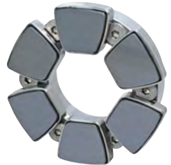
Ceramic Hidrax™ HT bearing