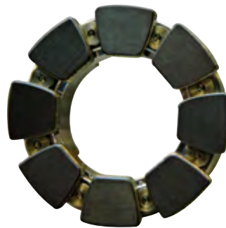
Polymer Hidrax™ bearing

Hidrax HT bearings use the well-proven Hidrax platform, making them ideal for drop-in replacement of existing polymer bearings as ESPs are updated with SAGD technology.