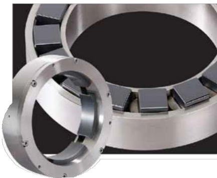
Figure 7 Ceramic bearings.

Ceramic bearings. Ceramic bearings (Fig. 7) can be used with virtually any liquid lubricant, making them the ideal solution for many challenging field conditions; liquefied gas, hydrocarbon condensates and seawater are commonly used. Pads and mating sleeves, or collars, are matched to suit the specific application and lubricant—even if it contains abrasives. Ceramic bearings are primarily used in pumps to provide more compact, lower-cost machines, thus saving weight, space, sealing and the expense involved with an oil lubrication system.