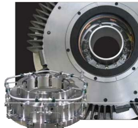
Figure 8 Vertical bearing assemblies.

Vertical bearing assemblies. Vertical bearing assemblies (Fig. 8) include a variety of design options, including electrical insulation, hydrostatic jacking and instrumentation. Proven designs range from large, self-contained combined-journal and thrust units for primary coolant pumps and motors used in nuclear power stations, to small, self-contained air-cooled units for LNG pumps. Air cooling has been increasingly used as it avoids the complications associated with water-filled coils and allows operation on remote sites where water may not be available. PTE