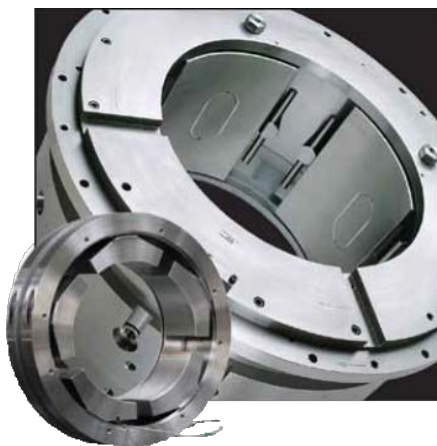
Figure 2 Tilting-pad journal bearings.