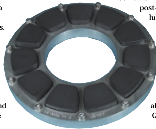
Fig. 2. Polymer thrust bearing for water-lubricated applications.

properties have seen polymers flourish in applications